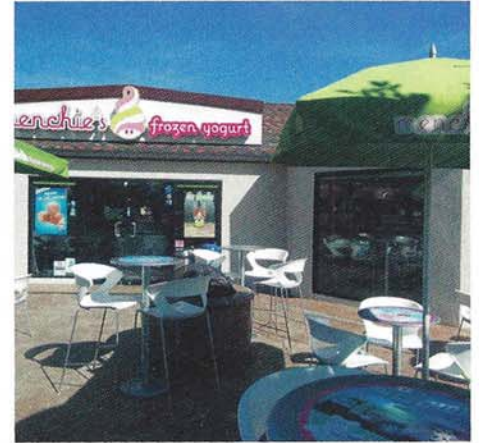
Use your receipt to donate a percentage of your May 5 purchases at Menchie's to your local school.

"How to Catch a Cold" is a story about a boy who goes to school and finds all his friends have stayed home. When his teacher explains that they all caught a cold, he goes out and literally tries to